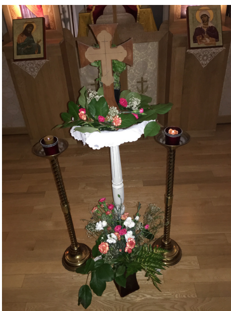
Flowers for Sunday of the Cross at our St. Olympia Chapel thanks to two generous donors

Both services at St. Olympia Chapel 123 Main Street