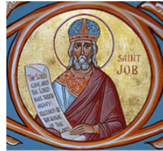
Righteous Job, the Long-Suffering May 6