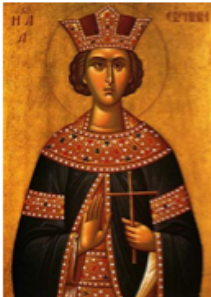
Great Martyr Irene May 5

The Orthodox Church reads the book of Job, the first of the seven wisdom books of the Old Testament, during Holy Week, drawing a parallel between Job and Christ as righteous men who suffered through no fault of their own. God allowed Satan to afflict Job so that his faithfulness would be proven. Christ, the only sinless one, suffered voluntarily for our sins. The Septuagint text of Job 42:17 says that Job “will rise again with those whom the Lord raises up.” This passage is read on Great and Holy Friday, when the composite Gospel at Vespers speaks of the tombs being opened at the moment the Savior died on the Cross, and the bodies of the saints were raised, and they appeared to many after Christ’s Resurrection (Matthew.27:52).