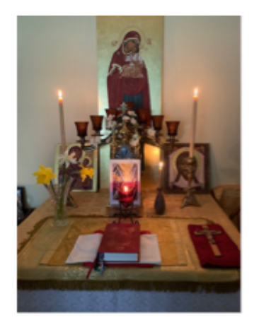
St Olympia's Feast Day at the Hermitage July 25, 2020

The Altar at the Hermitage, Icon of St Olympia by Mother Sophronia, Father Peter with Vladyka's gift, Trapeza after Liturgy