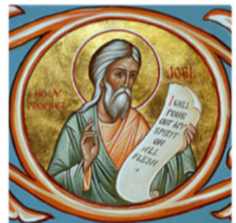
Prophet Joel October 19