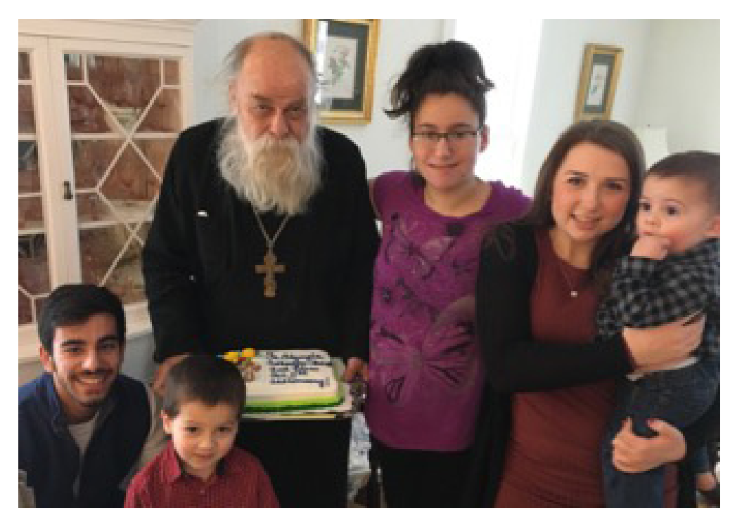
Our Orthodox Future

Visit us on Facebook or www.saintolympiaorthodoxchurch.org