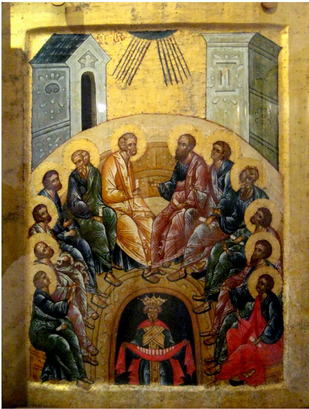
Icon from the Kirillo-Belozersky Monastery, Vologda region of northern Russia, c.1497

The icon of Pentecost below (as with all icons) depicts a spiritual truth. Here, twelve apostles are shown receiving the Holy Spirit as a tongue of flame. They represent all who were present that day (cf. Acts 1). The icon includes St. Paul among the twelve (although, historically, he would not have been present) as well as the four Evangelists (holding scrolls, although the Gospels were not yet written down). Below, still in darkness, is a kingly figure representing the cosmos. He is holding a cloth with twelve scrolls, representing the twelve tribes of Israel. It is to the entire world that the Word is to be proclaimed, to bring all those in darkness to the Light.