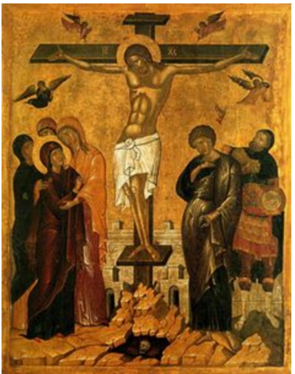
▲ Skull of Adam