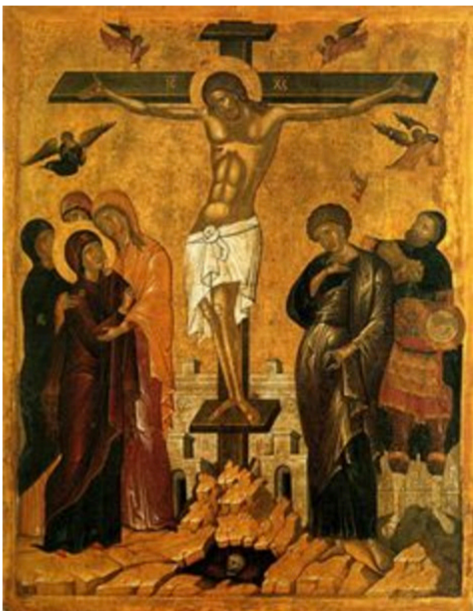
▲ Skull of Adam