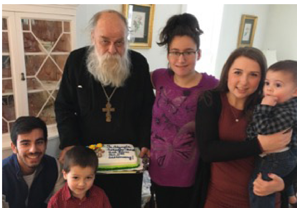
Our Orthodox Future

Visit us on Facebook or www.saintolympiaorthodoxchurch.org