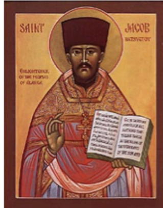
Rest of Saint Jacob Netsvetov Enlightener of the Peoples of Alaska